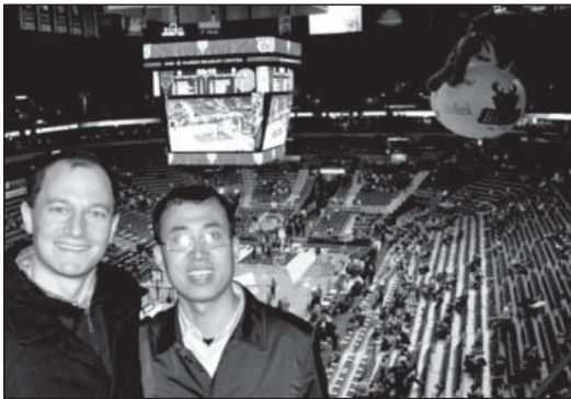
Students were invited to a Milwaukee Bucks game and more than 70 joined in the fun!

What a blessing to participate in God's work, as we "Go Here" to proclaim Christ!