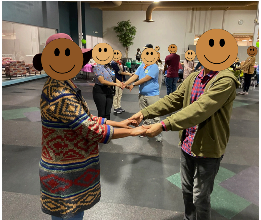
International students learn to square dance.