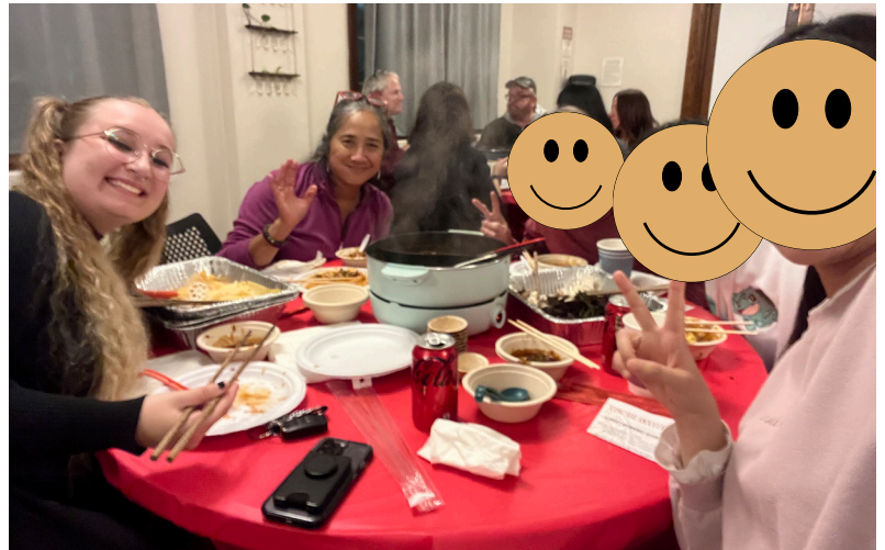
Our new East Asian friends shows us how to make authentic hot pot!

Even before I was formally installed, I received a request from someone who works with Chinese students on campus. He