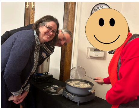
Chinese New Year party: learning to make Chinese dumplings.

In October, we held a Hot Pot party, inviting international students, our residents and local students. The goal was to introduce the residents and local students to the international students, and vice versa. Close to 40 people attended. The best part was that the Chinese students were the experts and were invested in sharing their culture