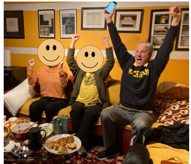
Two East Asian friends join us for the University of Michigan championship game.

I meditate on His Word and pray, I trust Him more. Third, it has been extremely important to recruit other believers who are also passionate about this ministry. Having a community