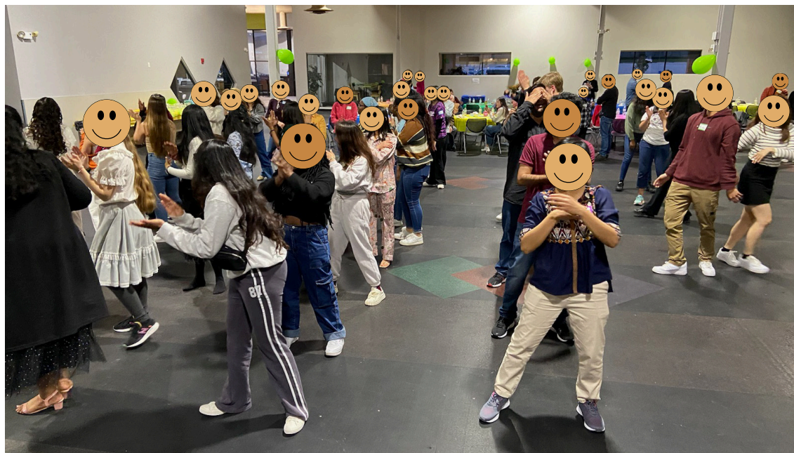
The international students also enjoyed learning to line dance.

When we say “yes” to God and accept the gift of volunteering, He calms our fears and enriches our lives. As there is opportunity for you to say yes to being a volunteer for ISM, go forth boldly. God will not disappoint. †